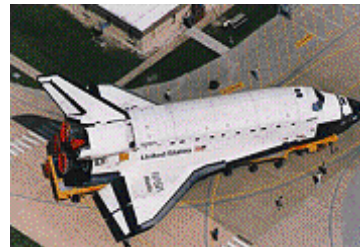
The most amazing space craft